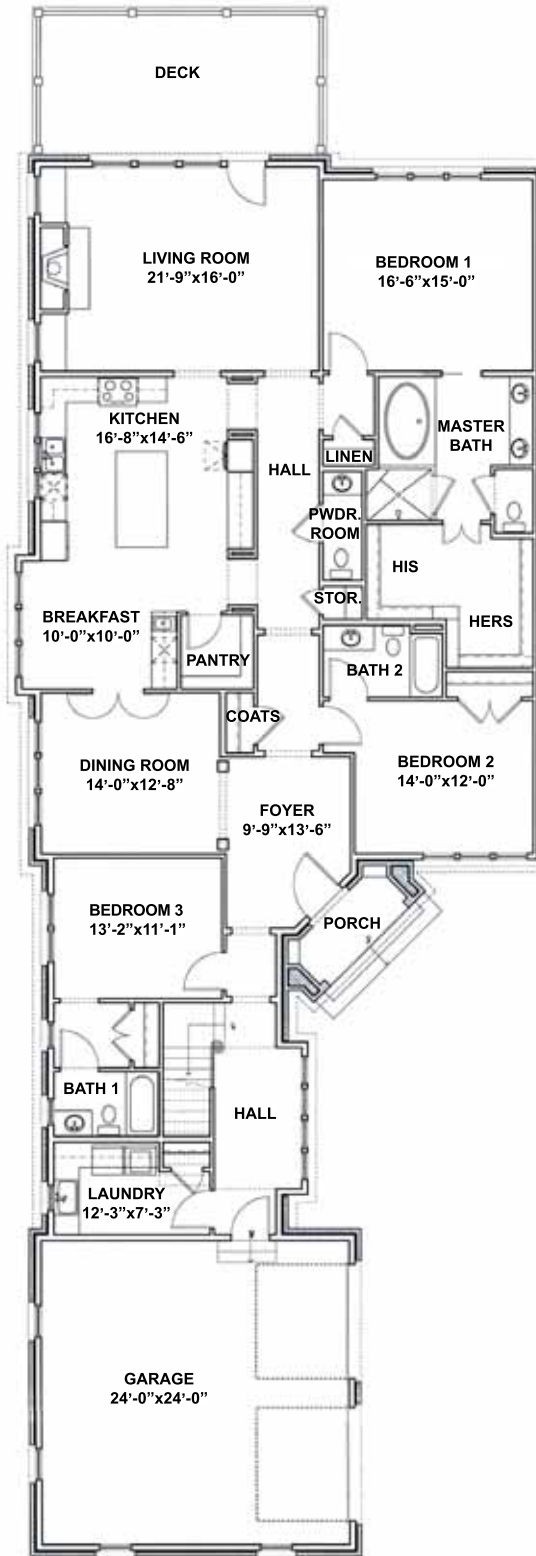
MAIN LEVEL | 2,745 HSF